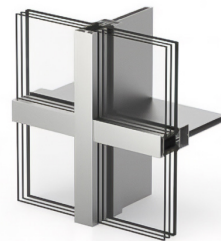
Narrow Interior Mullion Detail