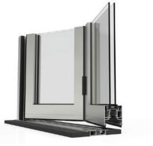
Embedded Low Threshold